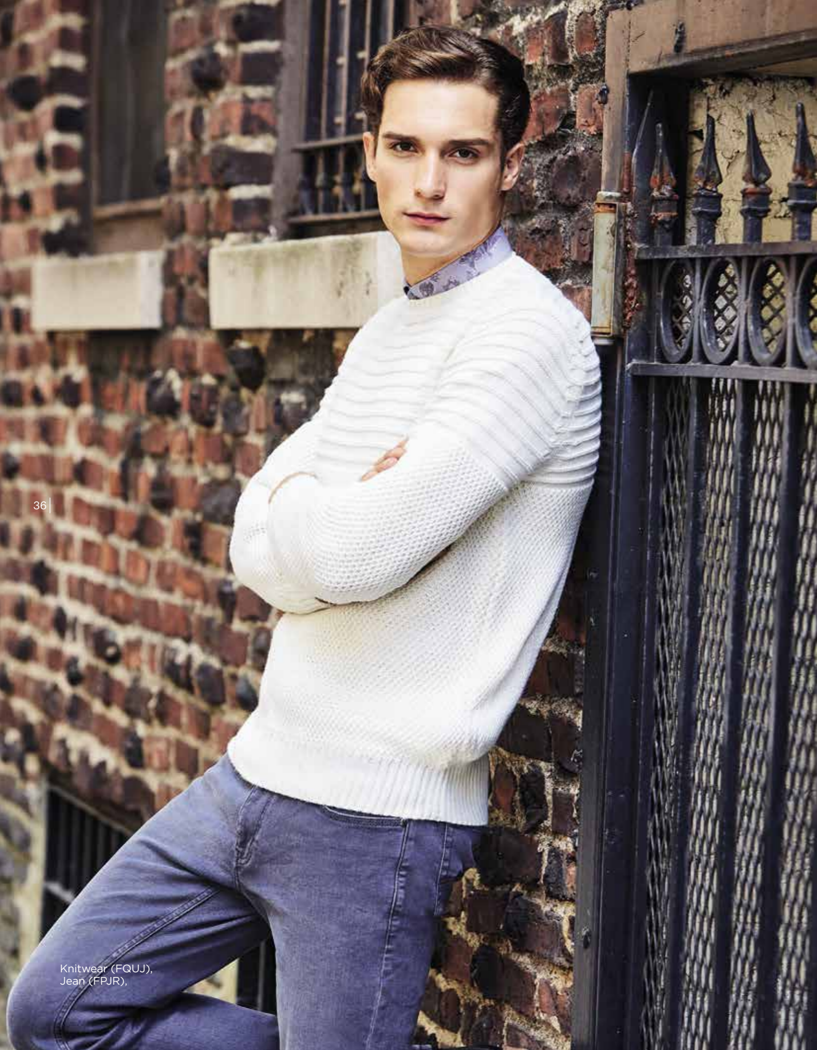
Knitwear (FQUJ), Jean (FPJR),