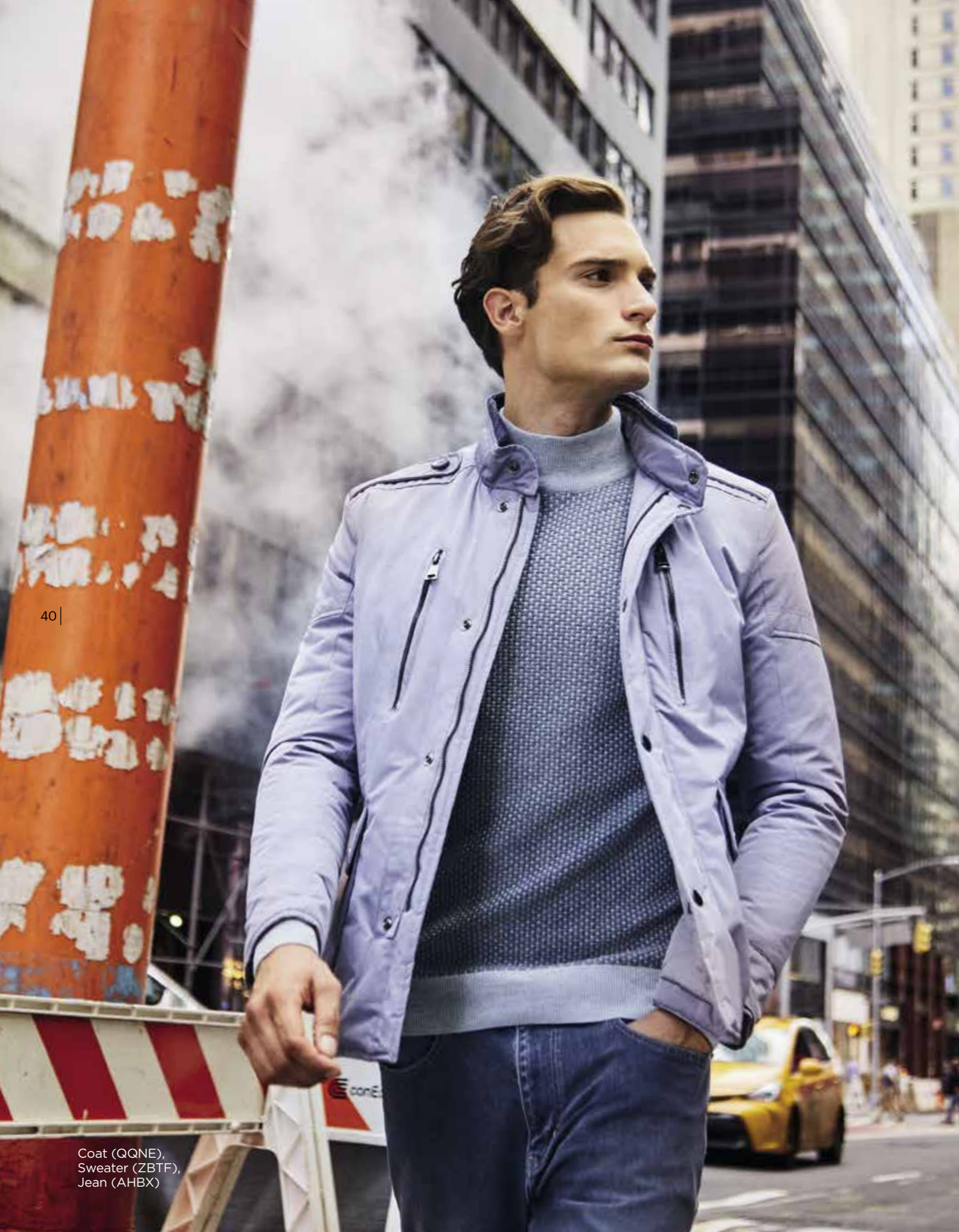
Coat (QQNE), Sweater (ZBTF), Jean (AHBX)