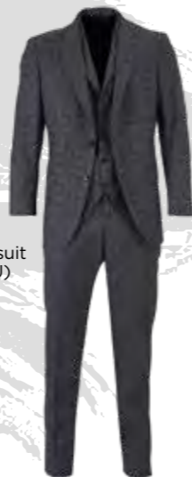
Vested suit (YCEU)