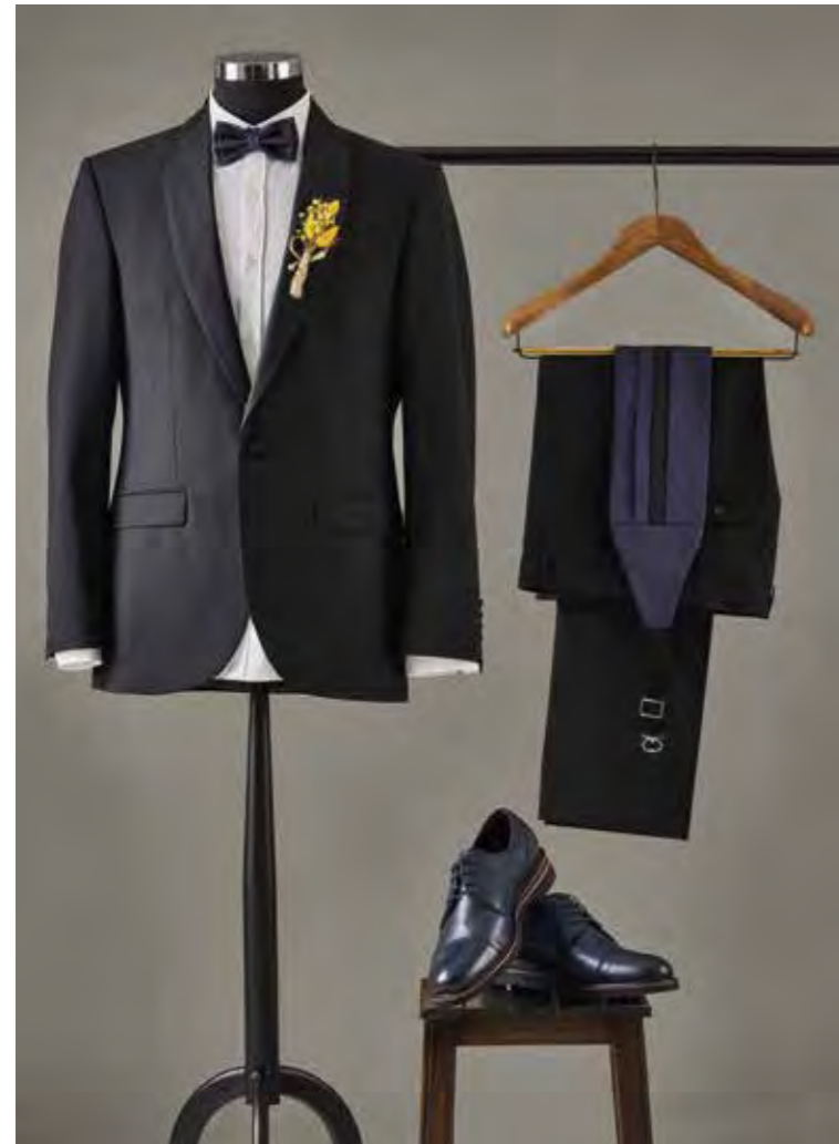
Tuxedo (KUSX), Shirt (KXKZ), Belt-Bow Tie Set (VNPF), Shoes (EHRU)

The suits open the doors to simple elegance for an ambitious style. They are integrated with the plaid pattern which is indispensable in the Autumn/Winter season of 2019-20. With their triple combination details, suits are candidates for being the most powerful weapon of the urban man. They are accompanied by tuxedos, the symbol of classic elegance. A black tuxedo with perfect stitching is the smartest way to reward yourself in the season.