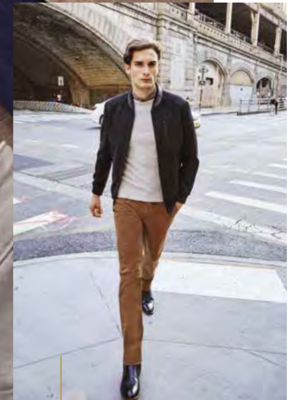
Bomber jacket (ZMFV), Sweater (SSPH), Trousers (NDNX), Shoes (EHPX)

Bomber jackets are also very trendy this season, as they can readily be adapted to any style. Especially with their zipper features, bomber jackets are one of the most helpful clothing pieces for men.