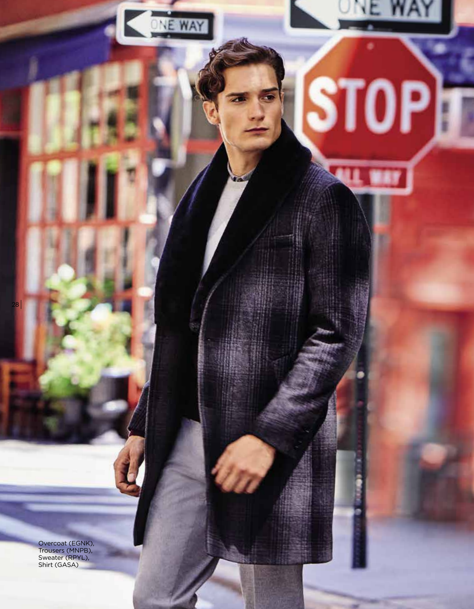
Overcoat (EGNK), Trousers (MNPB), Sweater (RPYL), Shirt (GASA)