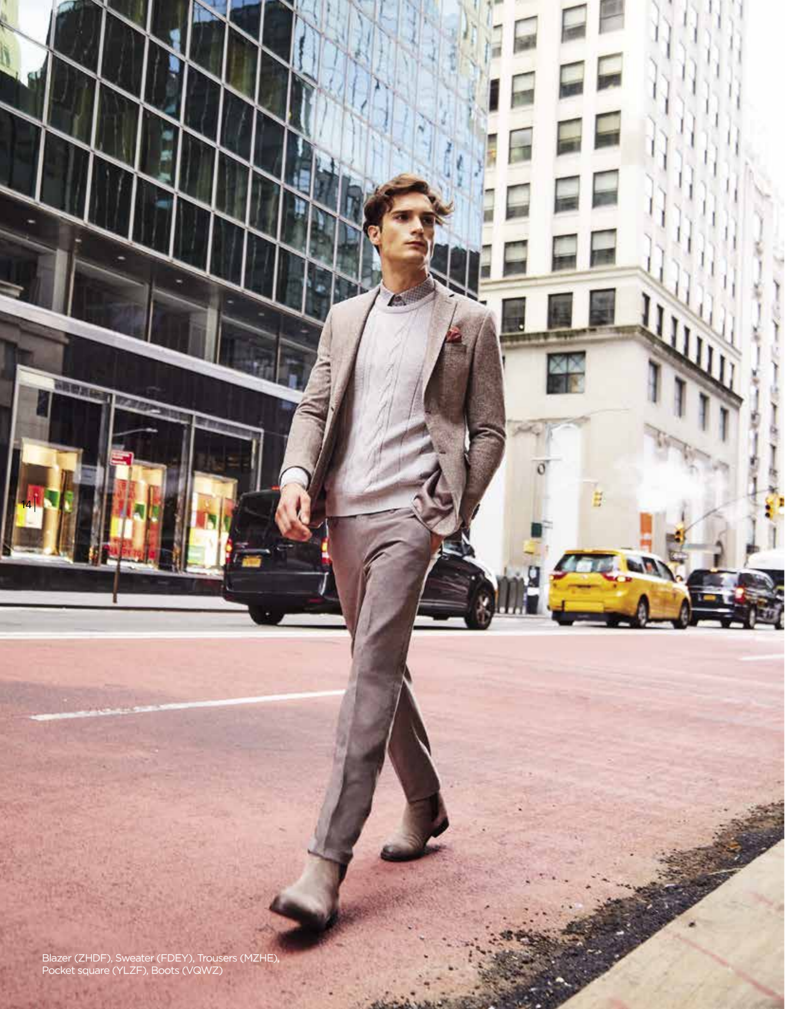
Blazer (ZHDF), Sweater (FDEY), Trousers (MZHE), Pocket square (YLZF), Boots (VQWZ)