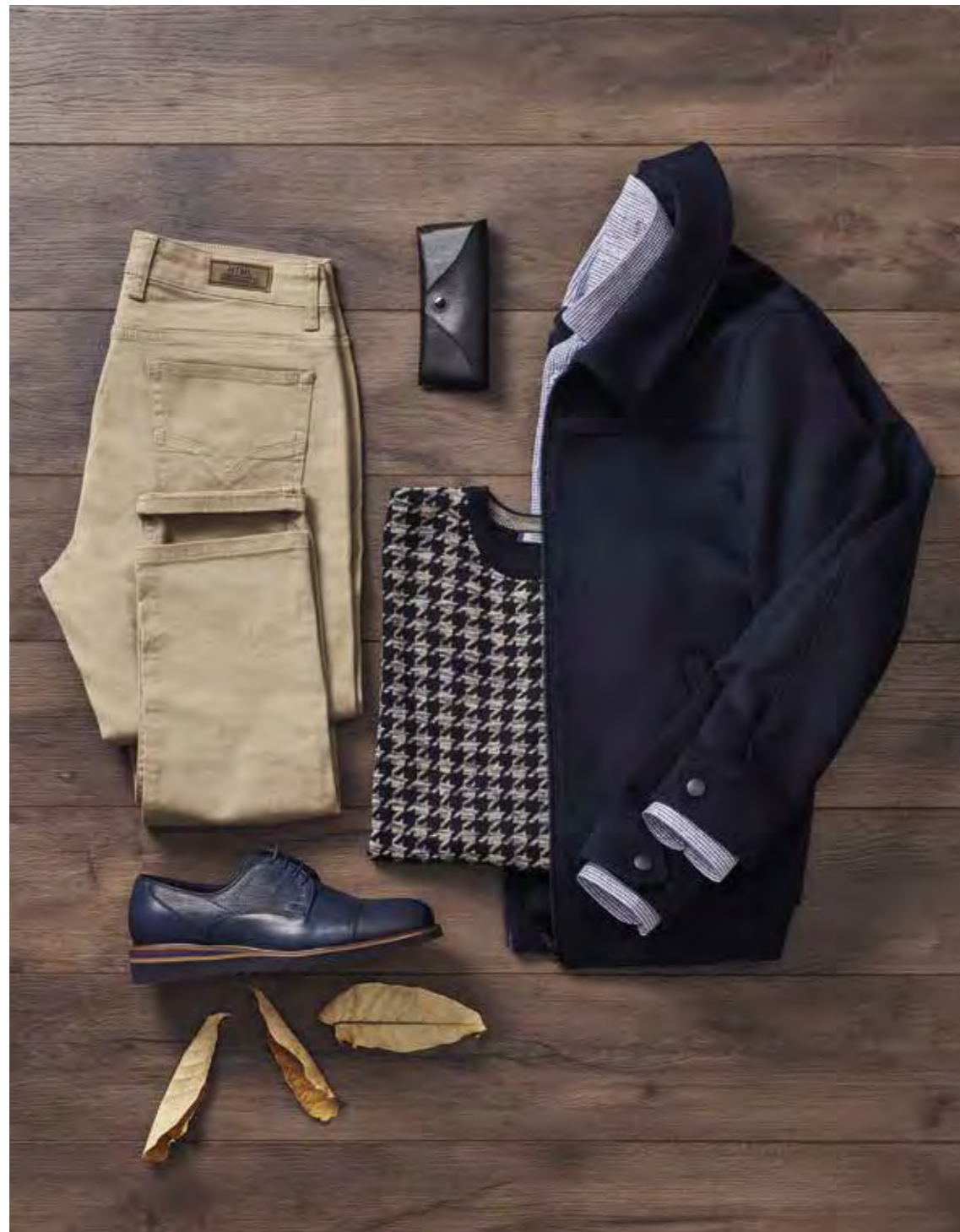
Coat (GFHD), Sweater (XUPS), Trousers (PJUG), Shirt (AAPJ), Shoes (FGBM)

CREATE CASUAL ELEGANCE BY COMBINING YOUR JACKETS WITH THE KNITWEAR CROWBAR PATTERN, ONE OF THE WINTER SEASON'S MUST-HAVES.