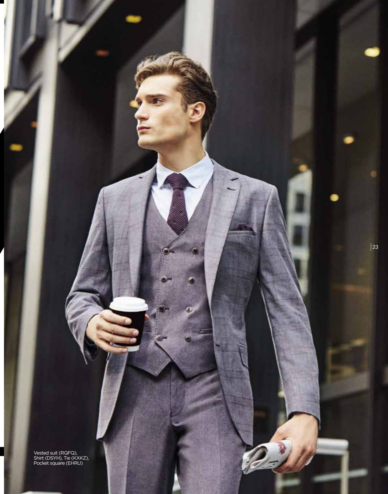
Vested suit (RQFQ), Shirt (DSYH), Tie (KXKZ), Pocket square (EHRU)