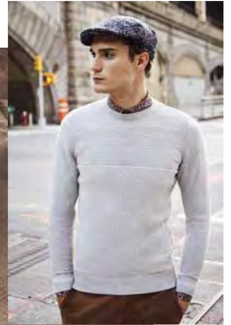
Sweater (SSPH) Trousers (NDNX), Hat (ZLKD)