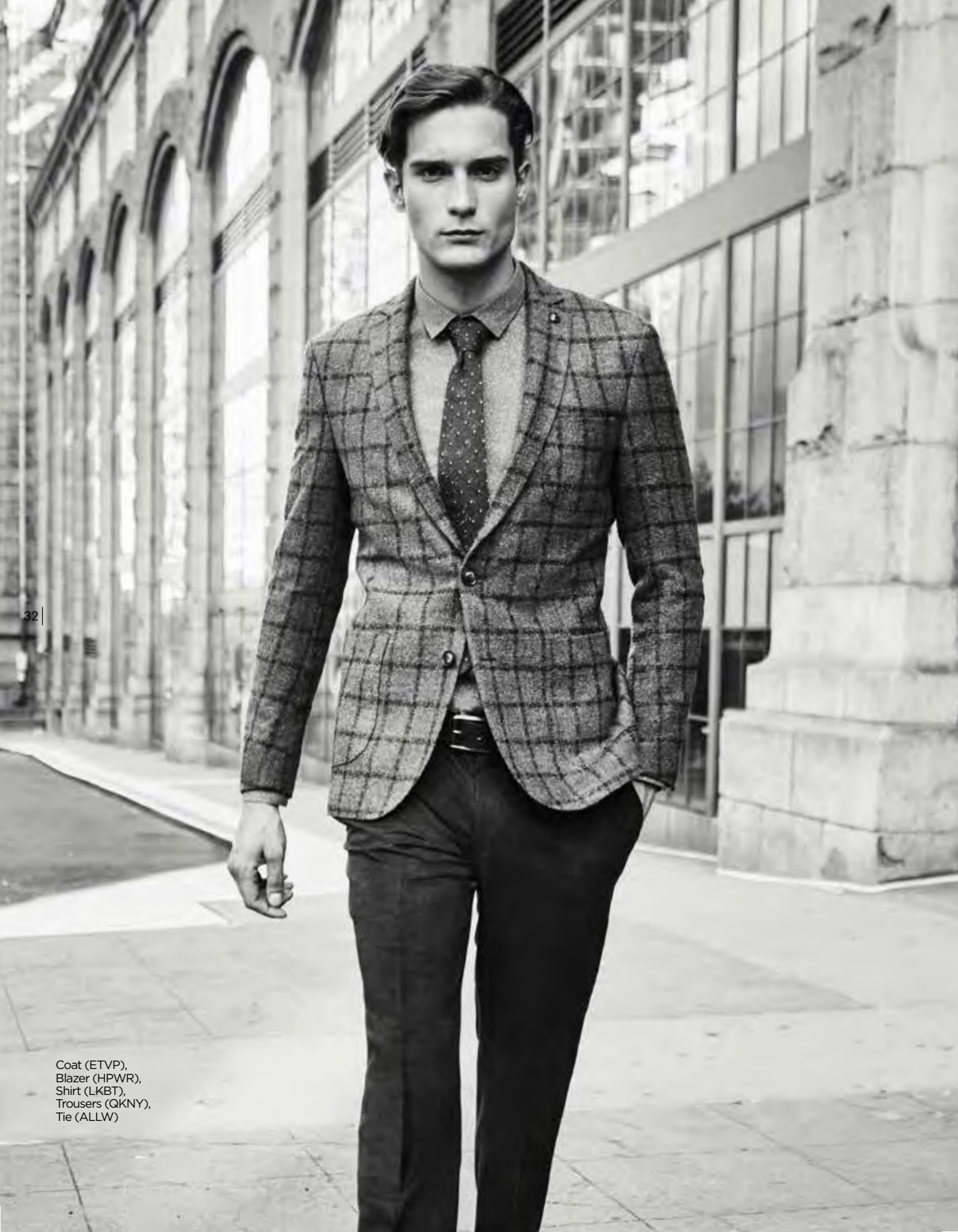
Coat (ETVP), Blazer (HPWR), Shirt (LKBT), Trousers (QKNY), Tie (ALLW)