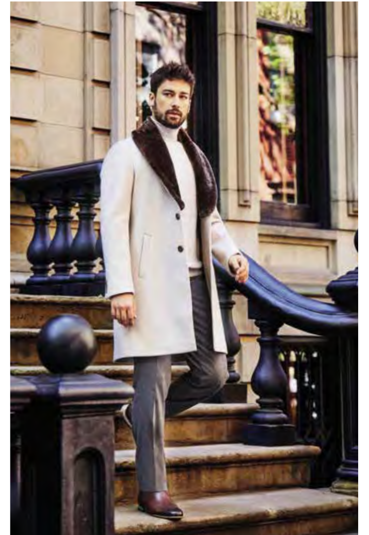
Overcoat (XSUQ), Turtleneck sweater (NAYH), Boots (SQBM)