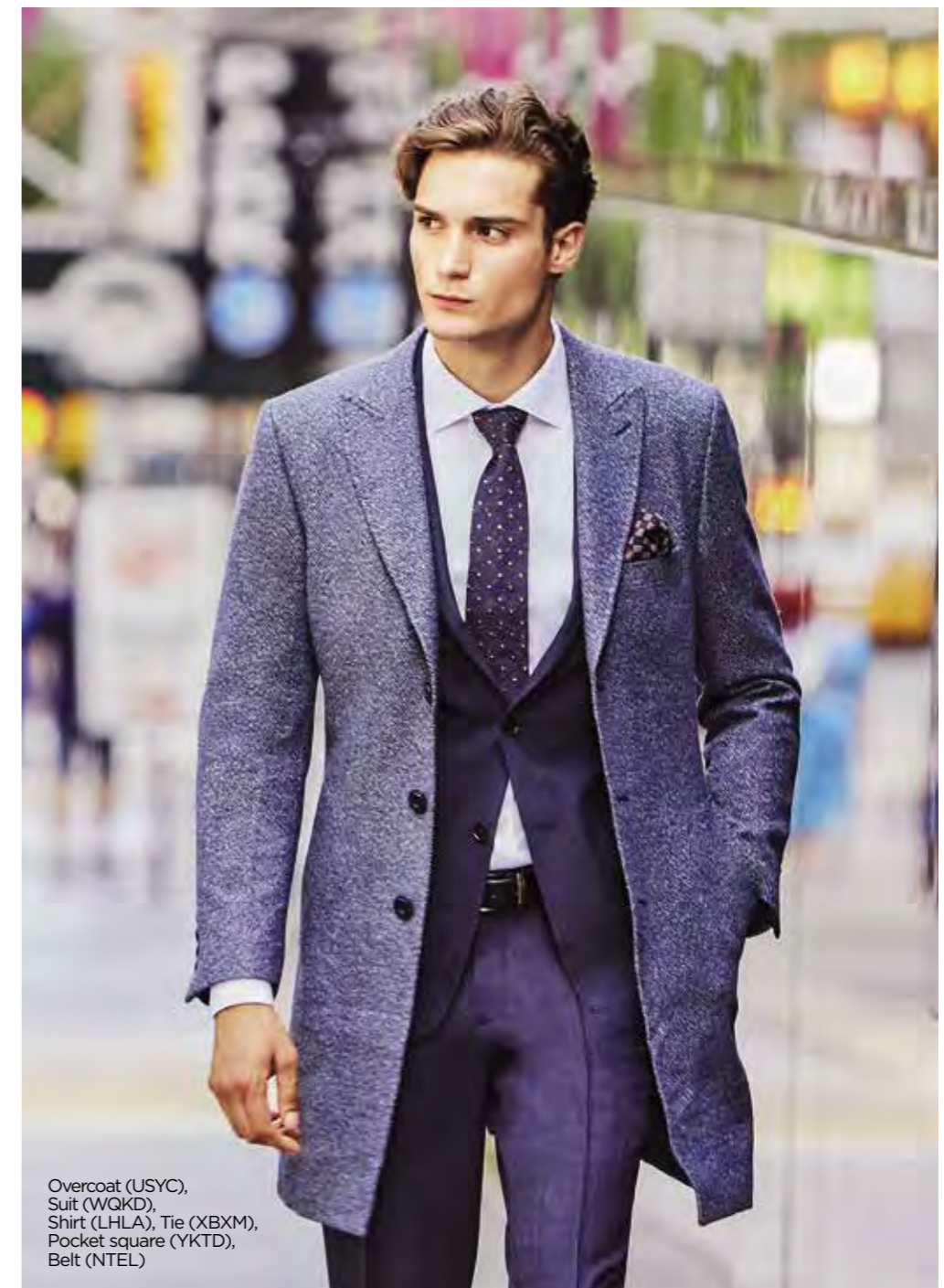
Overcoat (USYC), Suit (WQKD), Shirt (LHLA), Tie (XBXM), Pocket square (YKTD), Belt (NTEL)