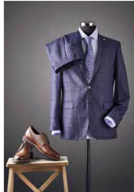
Suit (TMSD), Shirt (SRVU), Tie (GFHD), Shoes (XUPS)