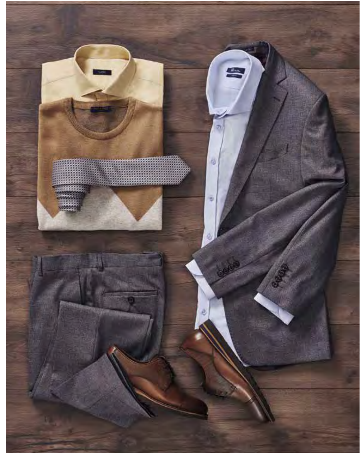
Suit (GFHD), Sweater (XUPS), Yellow Shirt (PJUG), Blue Shirt (PJUG), Shoes (JPLM), Tie (DNXH)

Tonsure of tone coffee tones and minimal jacquard patterns taking its place in showcases inspired by the fallen leaves with the arrival of Autumn is the savior of the season. The combination of jackets, patterned knitwear and shirts offers the key to easy elegance in everyday life, while navy and indigo colors with crowbar patterns draw attention to 2019-20 trends.