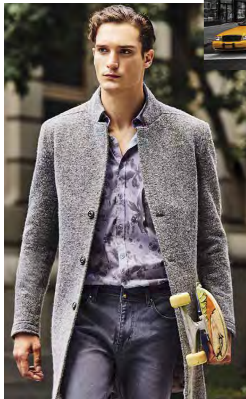
Overcoat (KDYQ), Shirt (NWVP), Jean (JFBW)

COMFORTABLE VELVET SHIRTS ARE AMONG THE RISING STARS OF 2019-20 FALL/WINTER TRENDS.