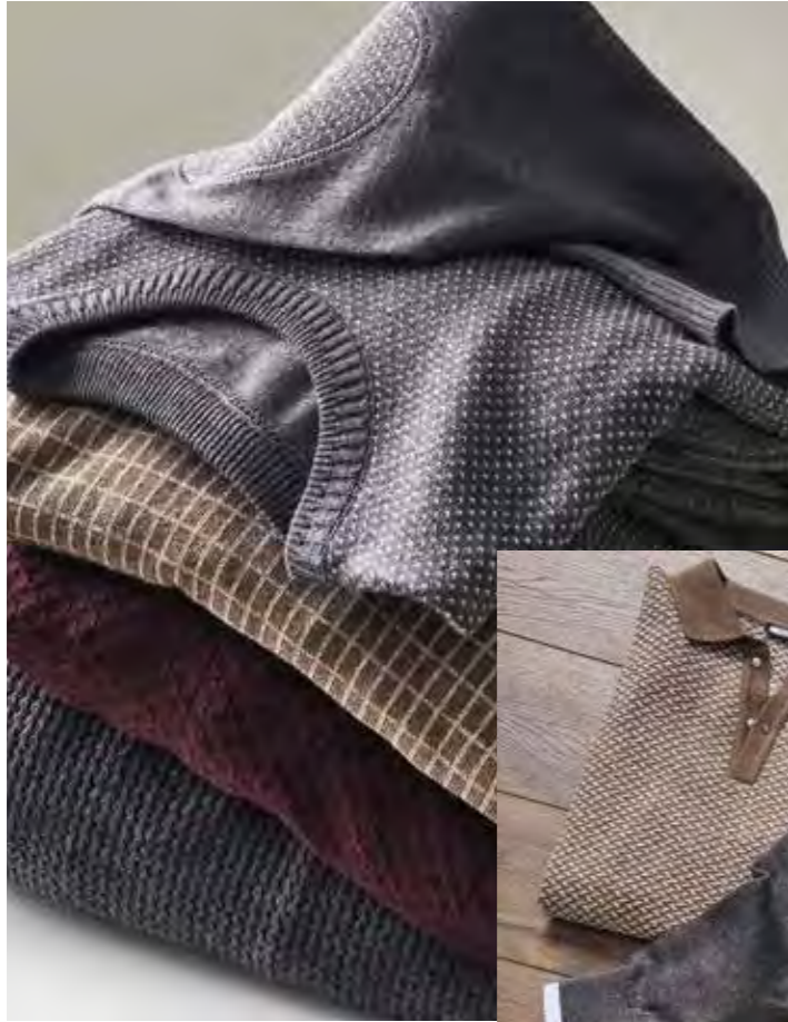
Dark Grey sweater (CZKA), Burgundy sweater (VQKY), Printed sweater (RTTB), Light Grey sweater (UAUW)