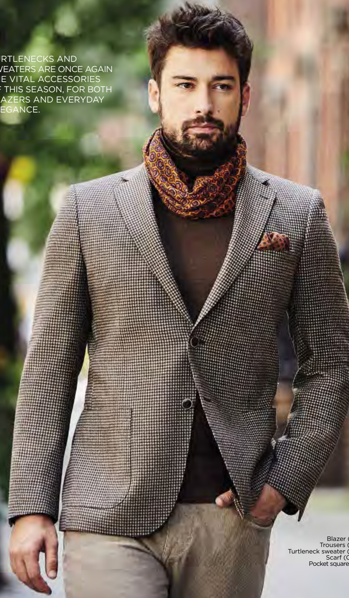
Blazer (FYGV), Trousers (BPPQ), Turtleneck sweater (DCKE), Scarf (CMWQ), Pocket square (SYBD)

TURTLENECKS AND SWEATERS ARE ONCE AGAIN THE VITAL ACCESSORIES OF THIS SEASON, FOR BOTH BLAZERS AND EVERYDAY ELEGANCE.