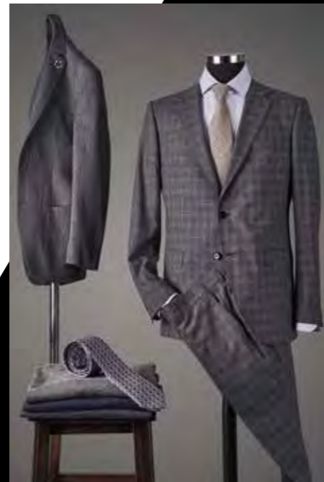
Suit (QAXT), Blazer (ECWW), Shirt (RGAX), Grey sweater (VDXW), Light grey tie (NHAN), Printed tie (VSVW)