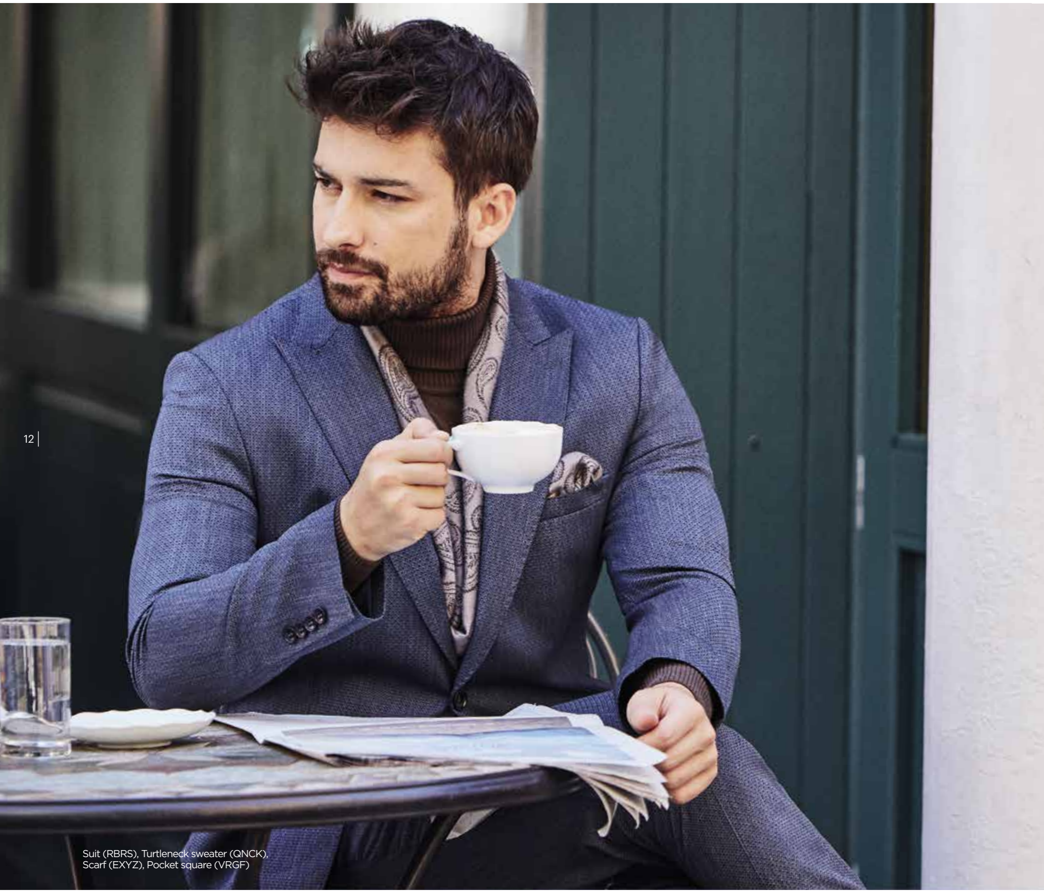
Suit (RBRS), Turtleneck sweater (QNCK), Scarf (EXYZ), Pocket square (VRGF)

Create unique contrasts in light and dark tones on the Neutral Palette .