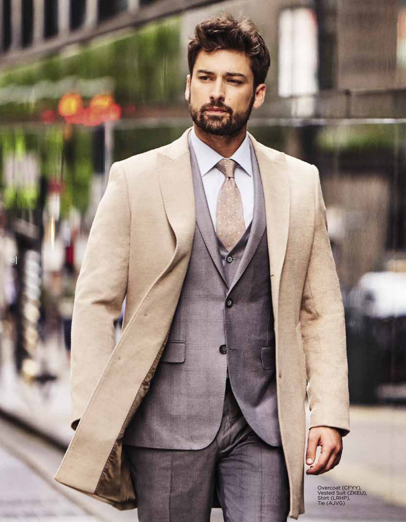
Overcoat (CFYY), Vested Suit (ZKEU), Shirt (LRHP), Tie (AJVG)