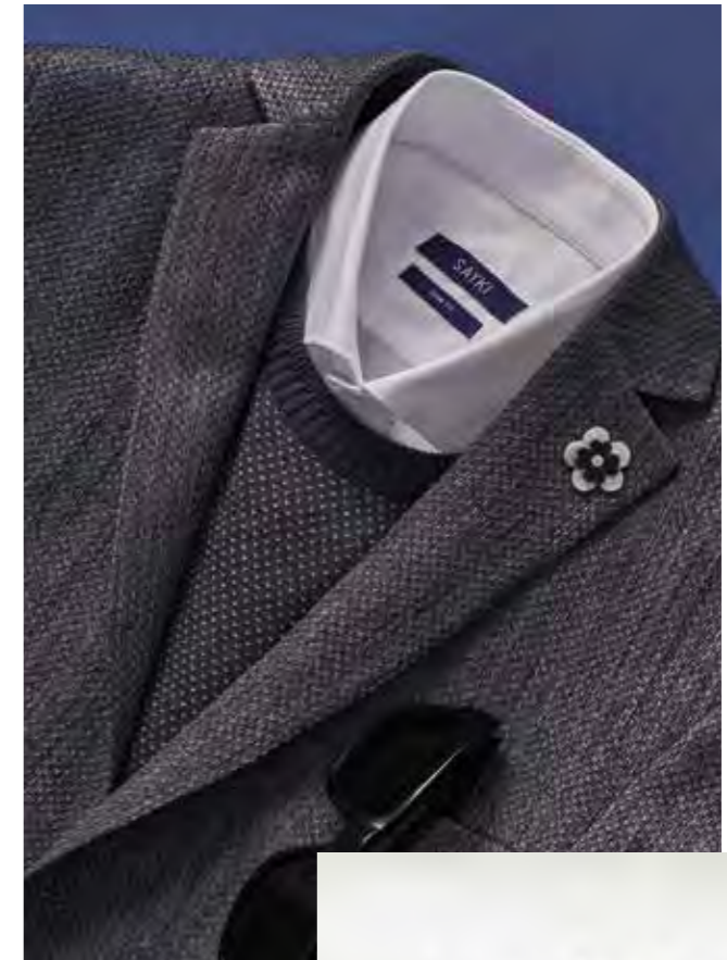
Blazer (GFHD), Sweater (XUPS), Shirt (PJUG)

Create unique contrasts in light and dark tones on the Neutral Palette .