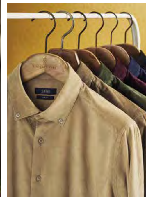
Velvet Shirt (LMAM), Beige Shirt (WNVE), Stone Shirt (PTNT), Khaki Shirt (BATU), Burgundy Shirt (XFNS), Navy Shirt (PPTZ), Black Shirt (YSGA)

COMFORTABLE VELVET SHIRTS ARE AMONG THE RISING STARS OF 2019-20 FALL/WINTER TRENDS.