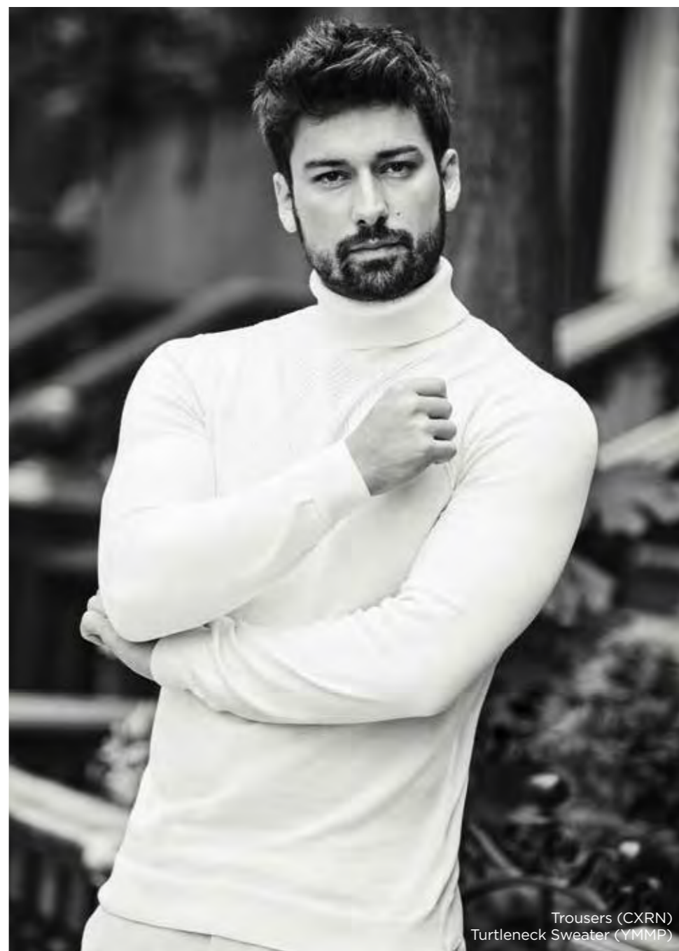
Trousers (CXRN) Turtleneck Sweater (YMMP)