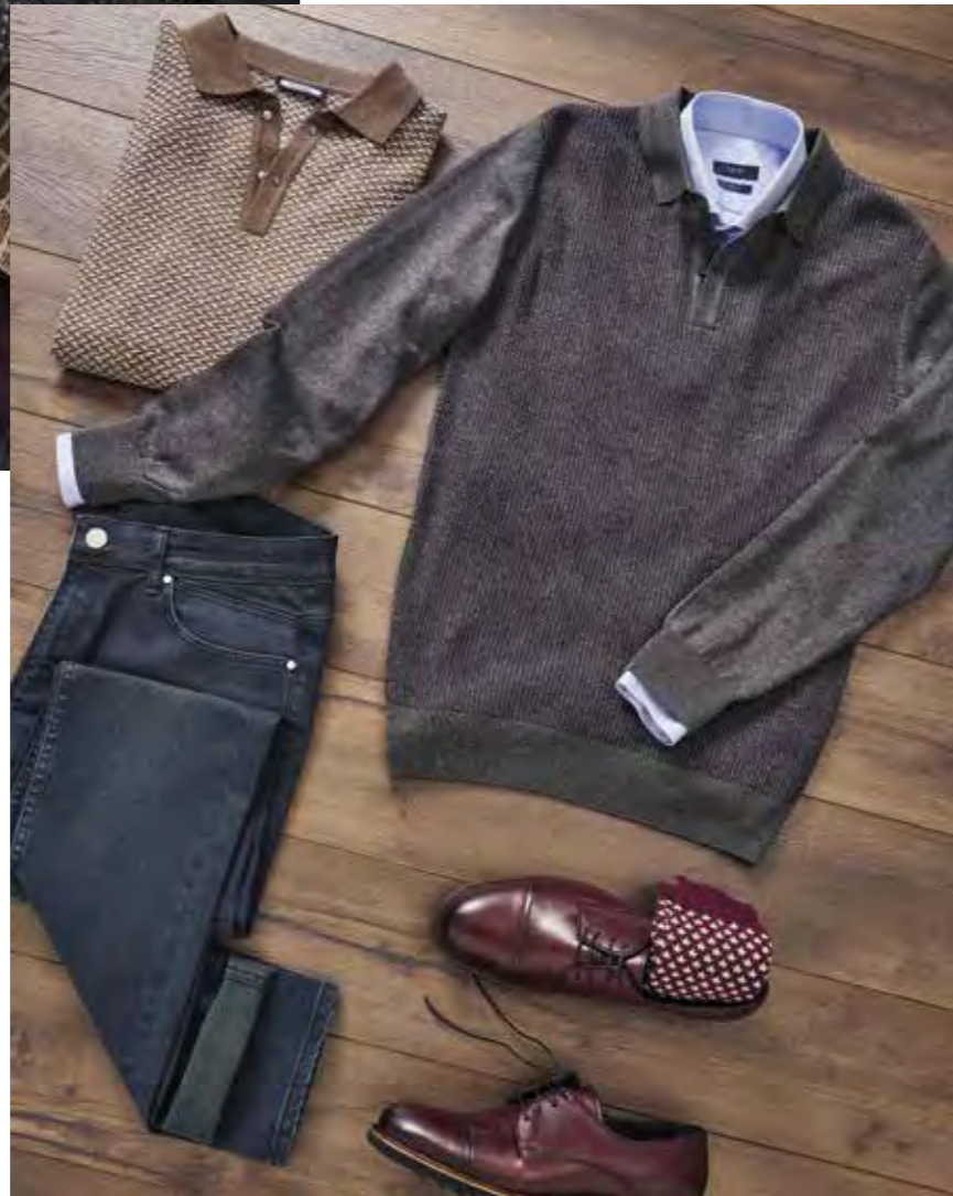
Beige sweater (UEAN), Grey sweater (JEPJ), Jean (VCKW), Shirt (MUUA), Shoes (PBQW), Socks (VCEV)

KNITWEAR, ONE OF THE BEST DETAILS OF CONTEMPORARY ELEGANCE AND WITH A VARIETY OF PATTERN CHOICES, IS THE SAVIOR ELEMENT OF THE CITY MAN.