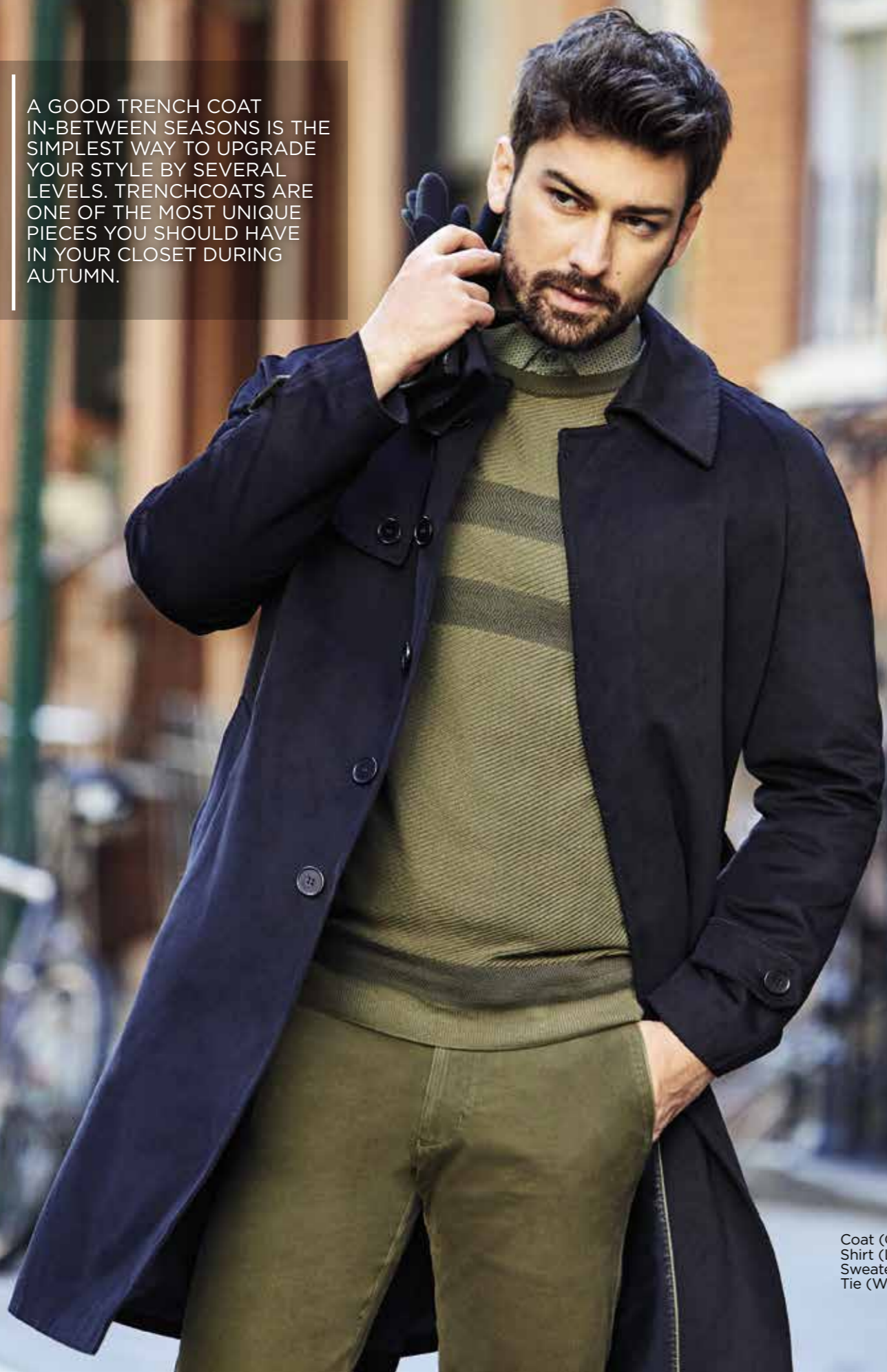
Coat (QGFA), Shirt (LCEW), Sweater (CBCG), Tie (WXYM)

A GOOD TRENCH COAT IN-BETWEEN SEASONS IS THE SIMPLEST WAY TO UPGRADE YOUR STYLE BY SEVERAL LEVELS. TRENCHCOATS ARE ONE OF THE MOST UNIQUE PIECES YOU SHOULD HAVE IN YOUR CLOSET DURING AUTUMN.