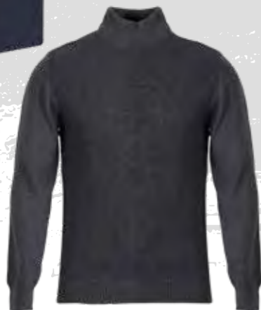
Turtleneck sweater (PKDX)