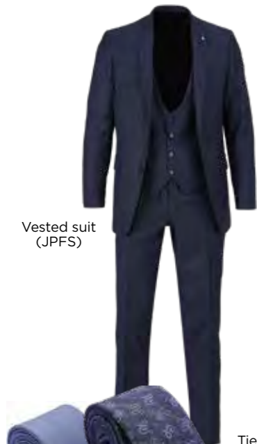
Vested suit (JPFS)