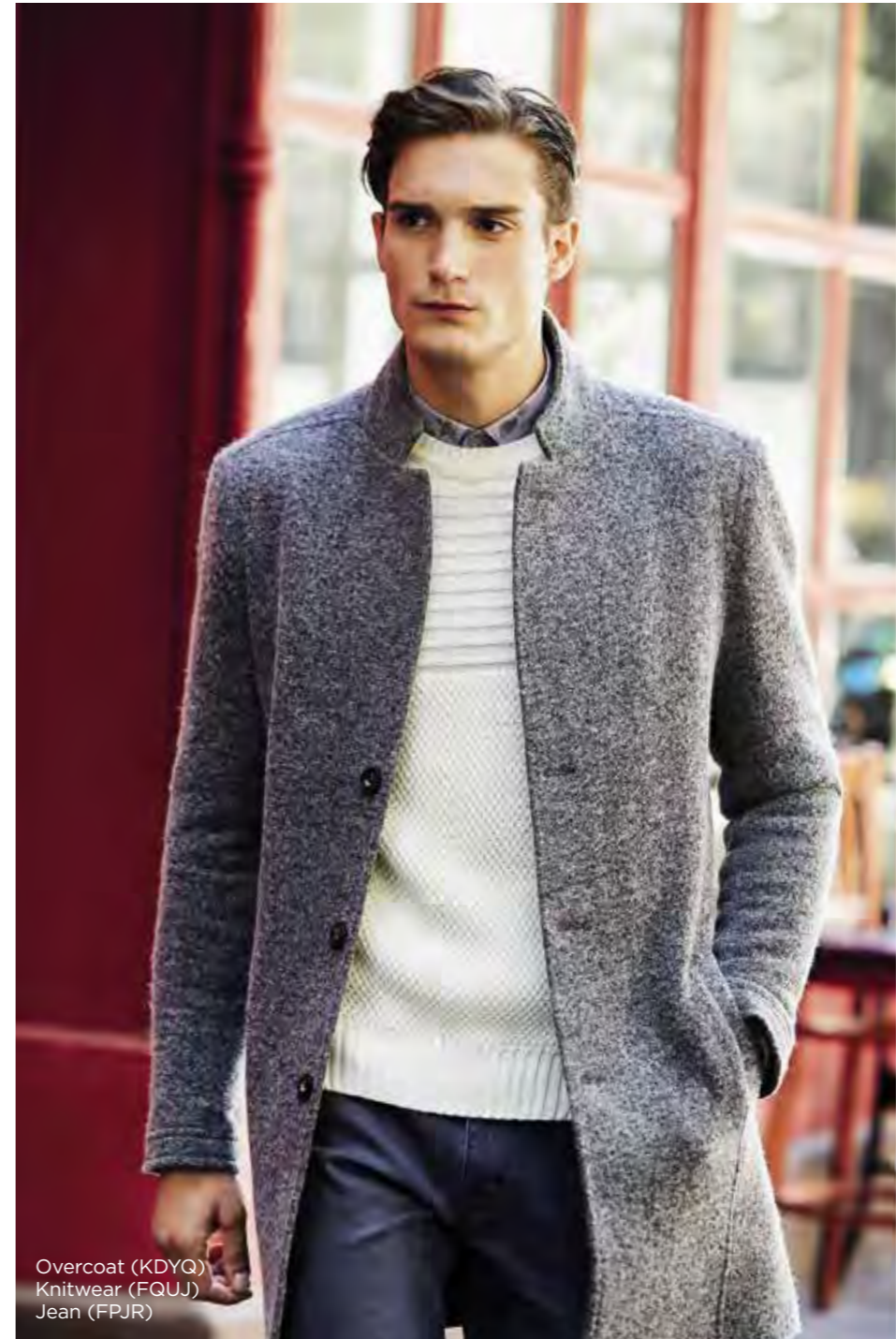
Overcoat (KDYQ) Knitwear (FQUJ) Jean (FPJR)